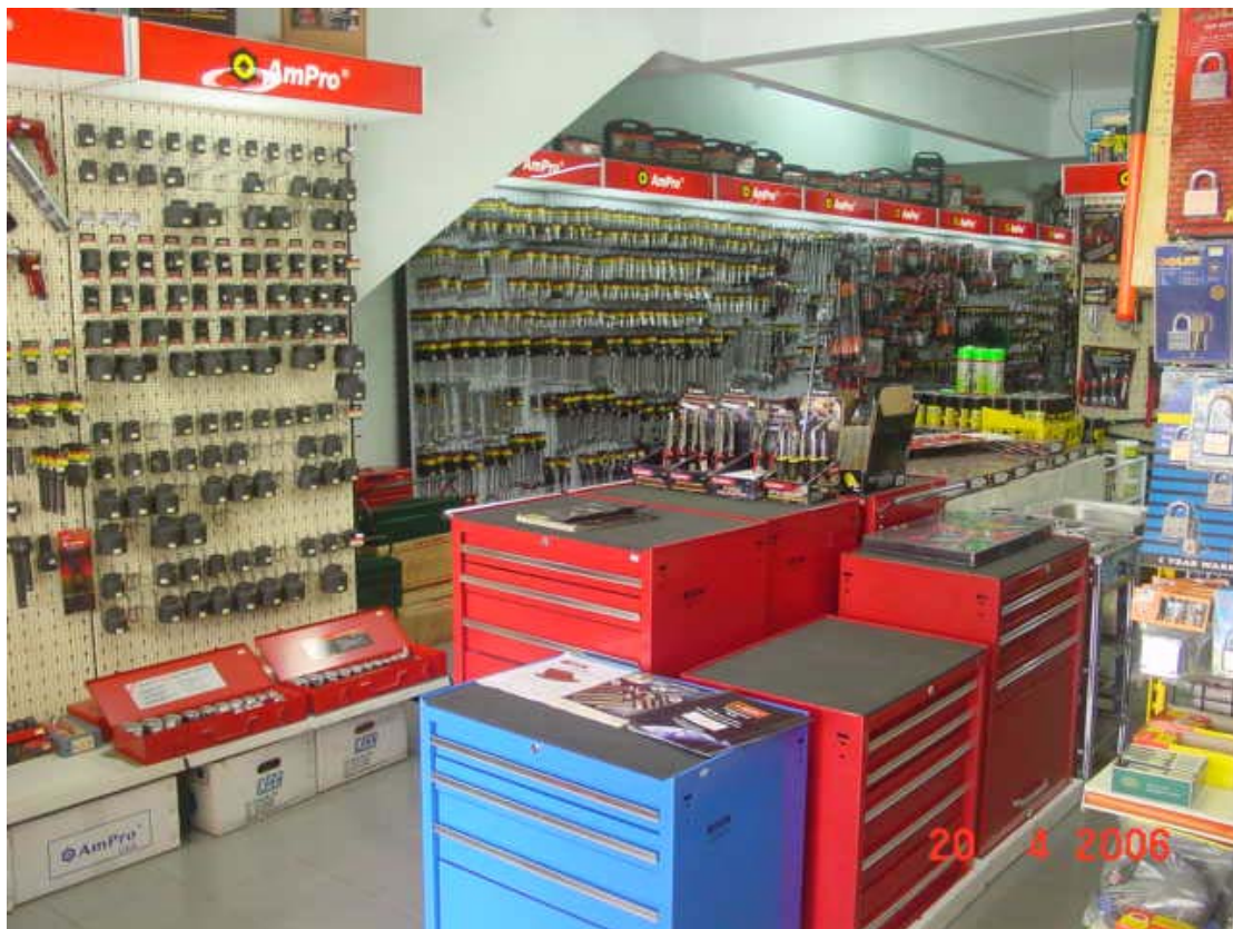
Part of our shop interior display

Email Contact : egtools@gmail.com / sales@egtools.com.sg