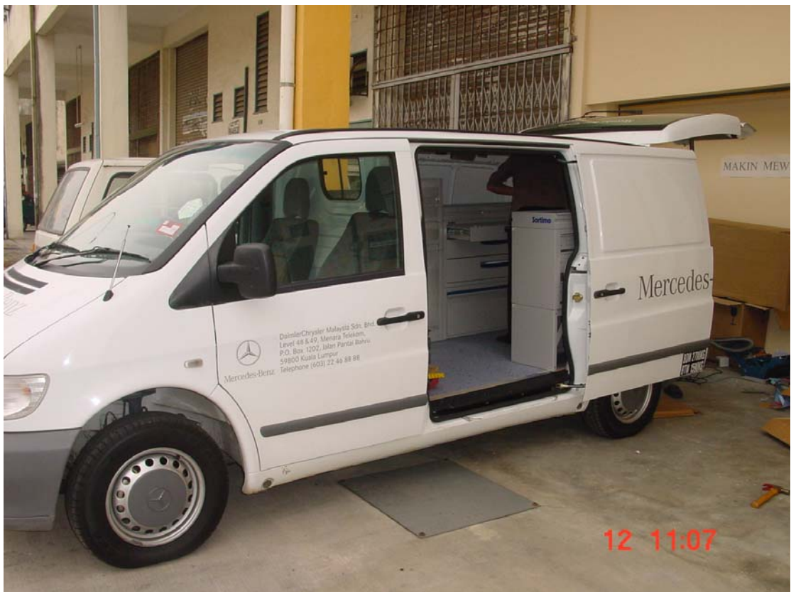
Installation of Sortimo System for Daimler Chrysler