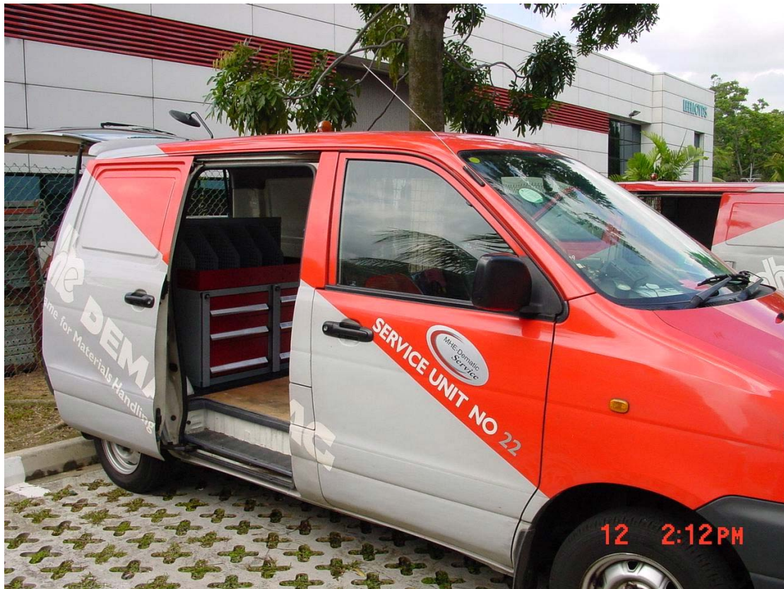
Installation of Bott Van System for MHE Demag service van