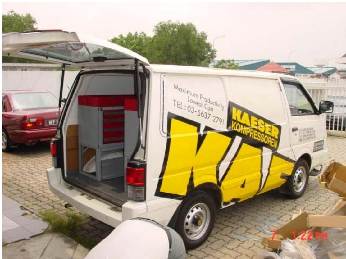
Bott Van Mobile system installation for Kasser Compressor Sdn Bhd